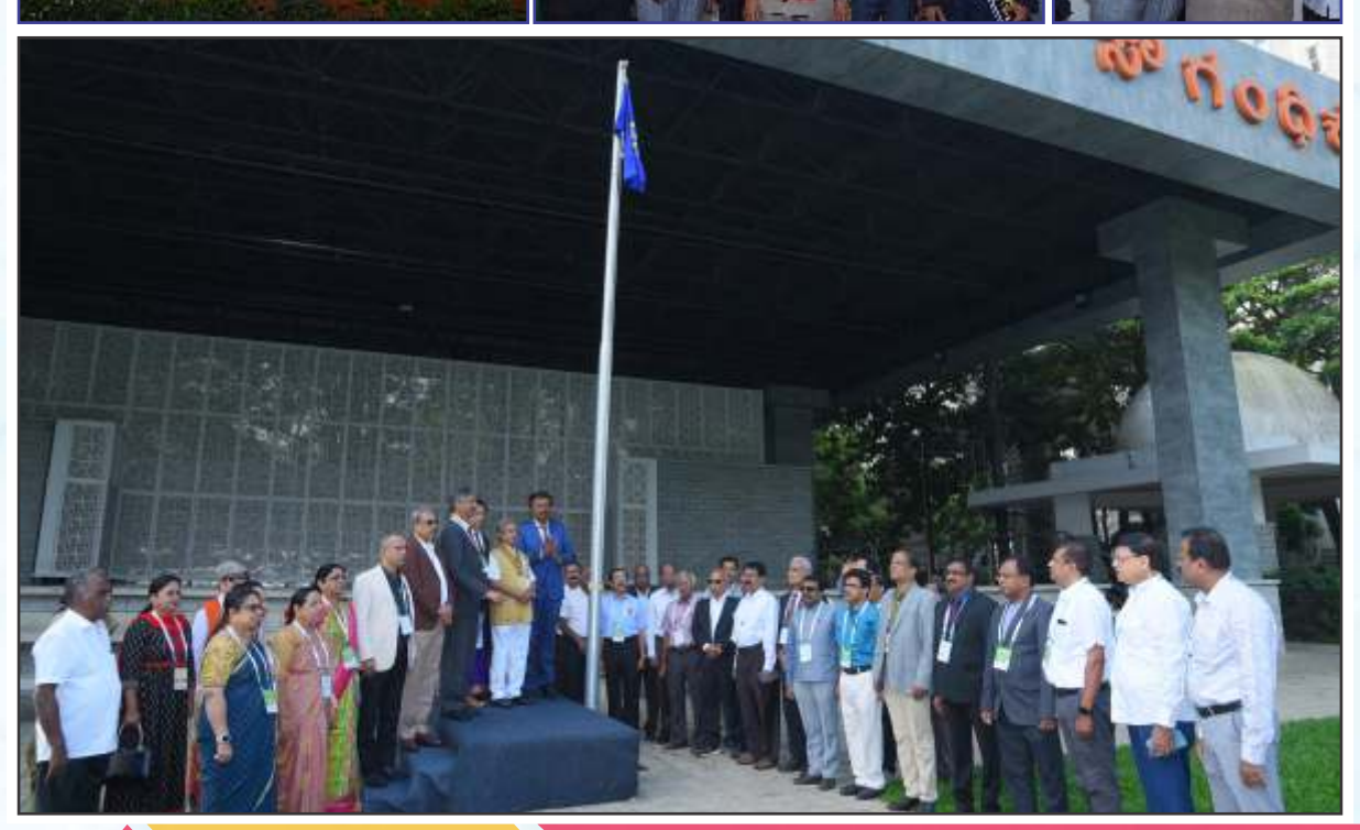
Page No. 13