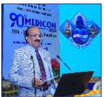
Page No. 14