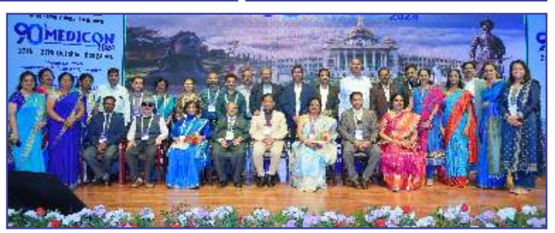
Page No. 15